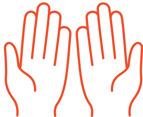
Hands to Self